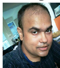
By: Dr. Aniruddha Babar

The movement of the Eastern people for the restoration of constitutional rights through separate constitutional entity has been rising through the struggle of decades. The first breakthrough that the movement achieved was through the 'Public mandate'. The movement for Frontier Nagaland is not run by the leaders but the people of the Eastern region. Movement is neither concentrated nor contained in the hands of ENPO leaders but spread in the nook and corner of the region of Eastern Nagaland.